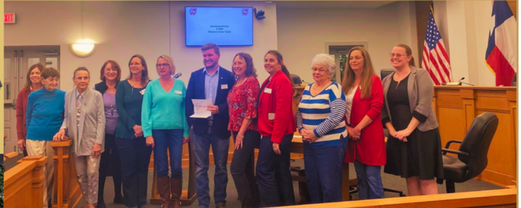
Bell County Executive Committee Meeting February 13, 2023

CTRW-PAC supports our local Bell County Republican Party with a donation during their monthly Executive Committee Meeting. Many of our CTRW members serve as Volunteers, Precinct Chairs and have supporting positions during Bell County Elections.