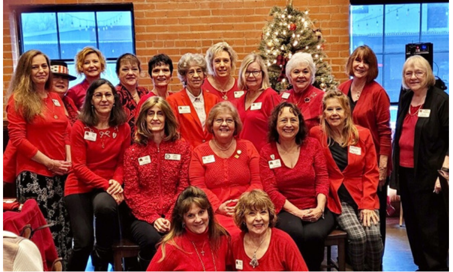
Photo from the December 2023 CTRW Installation Luncheon at The Gin Restaurant in Belton, TX

If you are interested in serving on a committee, please get in touch with one of these stellar ladies.