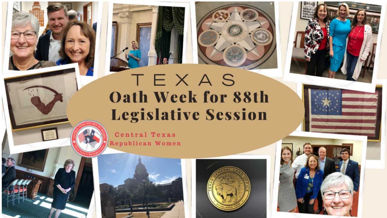
Members visited our beautiful General Land Office, Archives, and House of Representative in Austin, TX