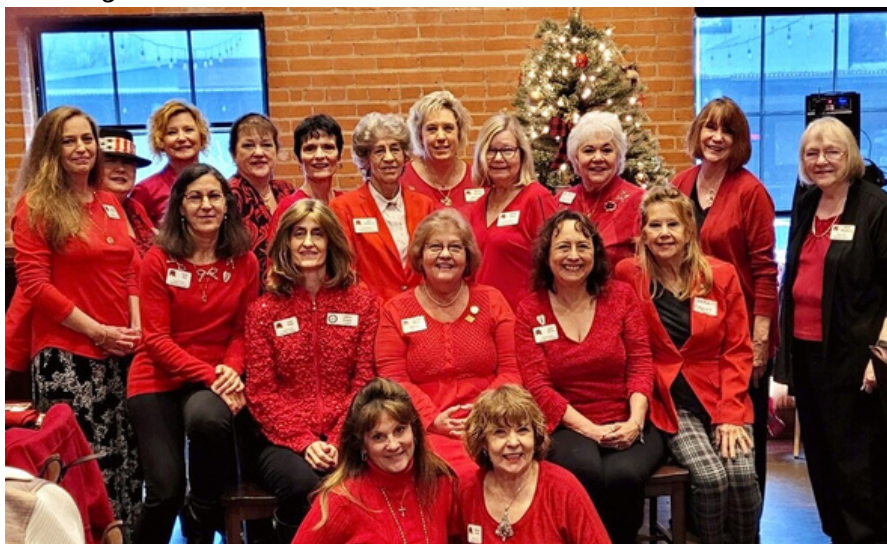
Photo from the December 2023 CTRW Installation Luncheon at The Gin Restaurant in Belton, TX

If you are interested in serving on a committee, please get in touch with one of these stellar ladies.